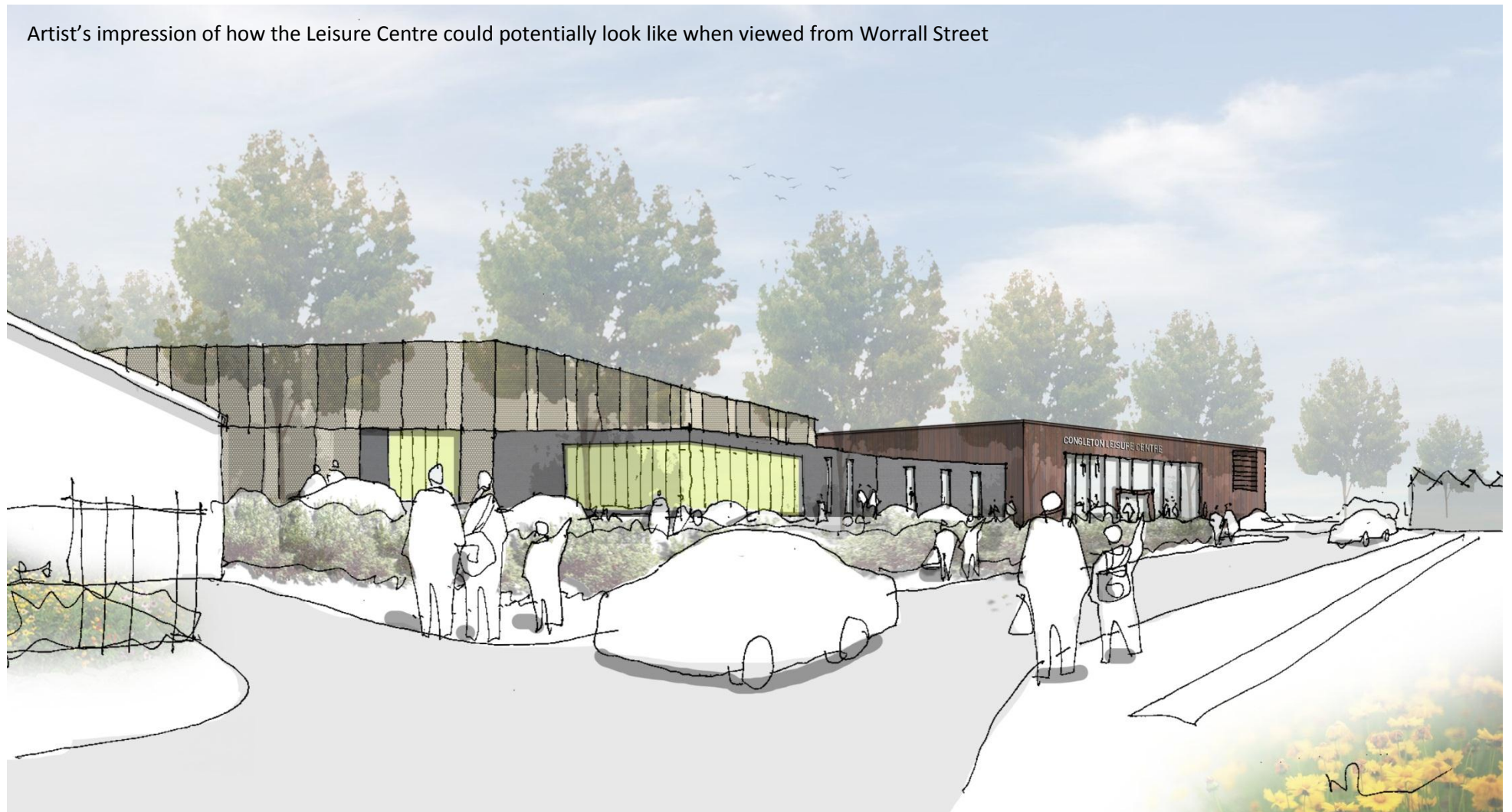
Artist's impression of how the Leisure Centre could potentially look like when viewed from Worrall Street